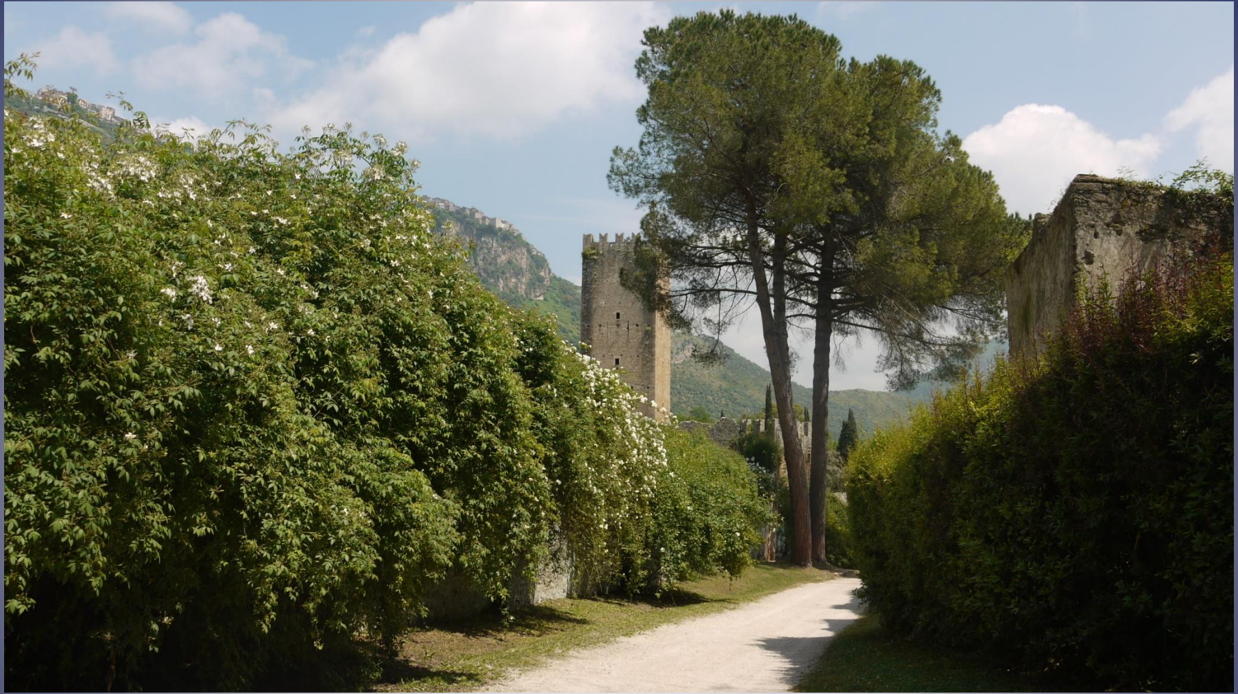
Ninfa, Italy: the ultimate romantic garden