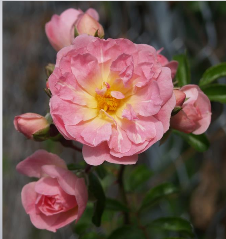
La Fraicheur, 1921

“There’s always room for a rambling rose....”