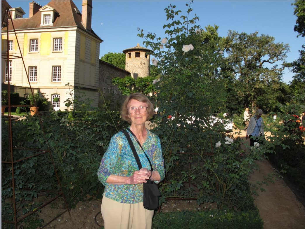
Chateau de Lacroix-Lavelle