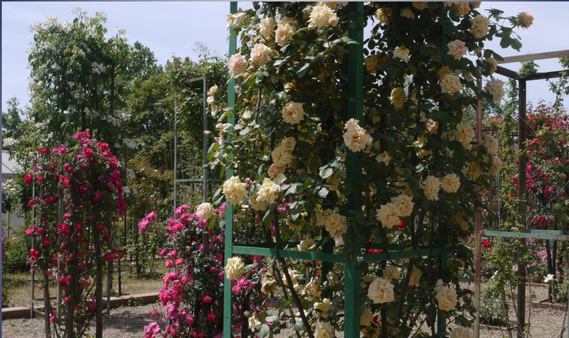
Carla Fineschi Rose Garden, Cavriglia, Italy