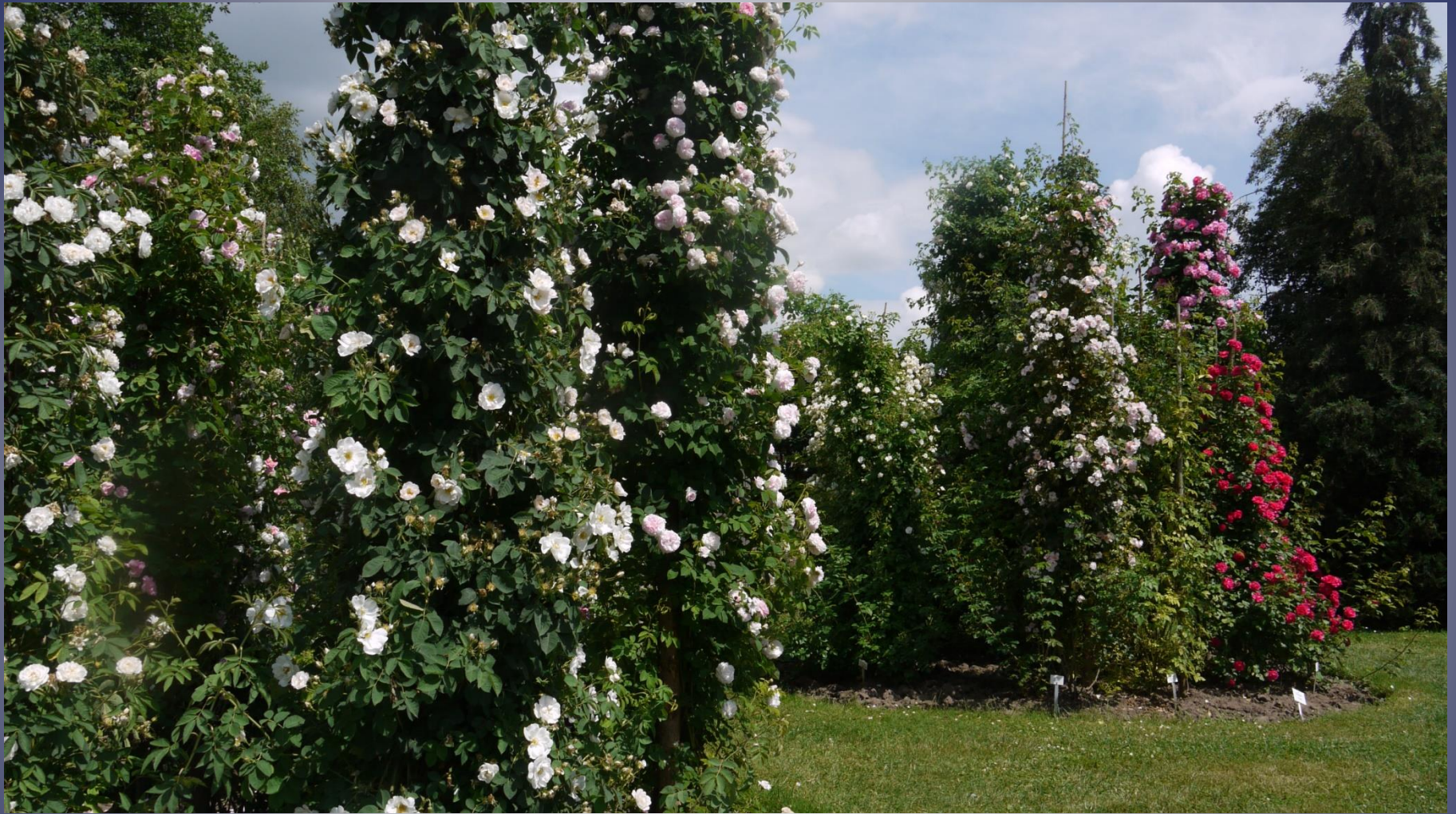
Europa Rosarium, Sangerhausen, Germany