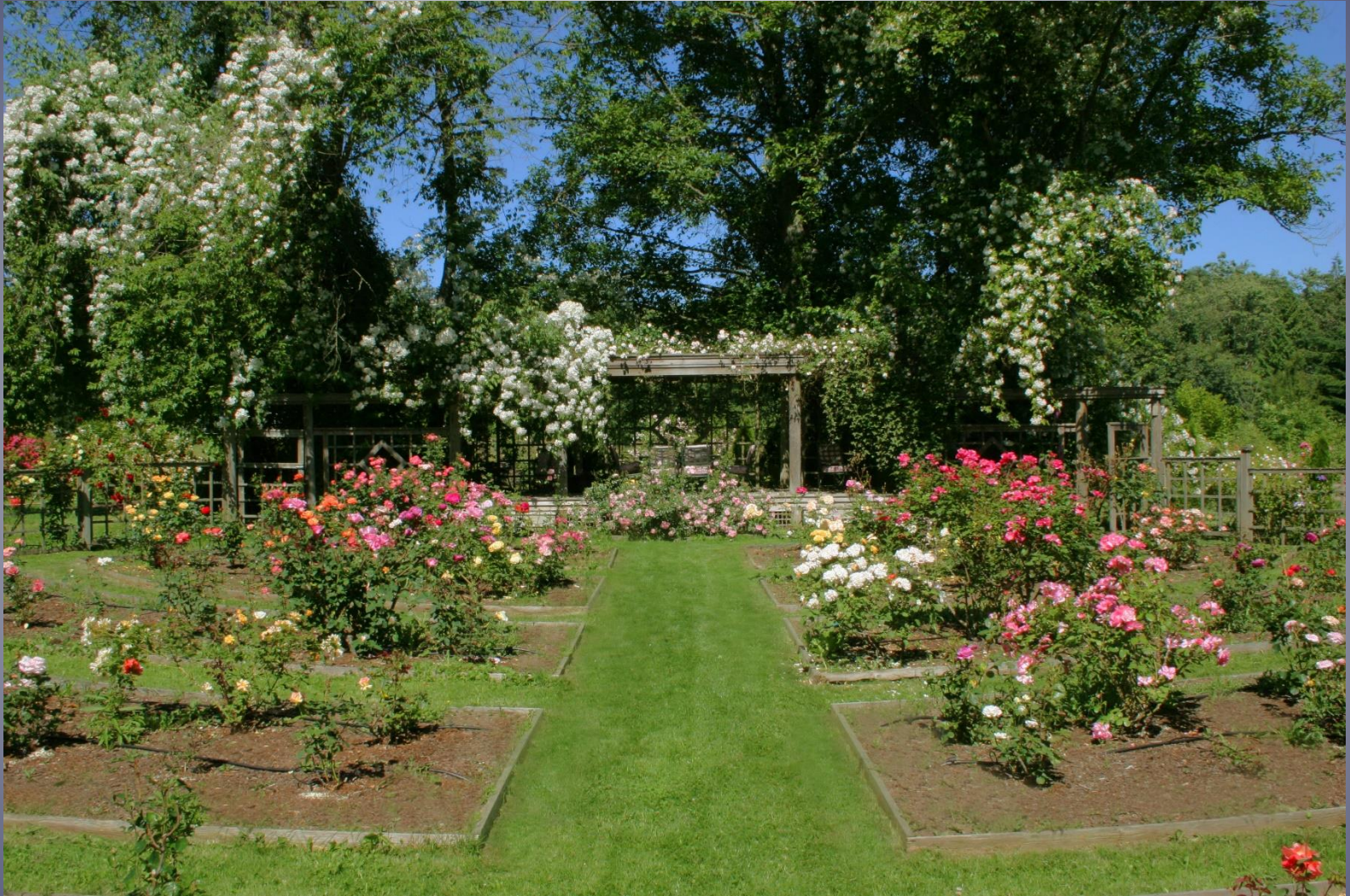
Clouds of Roses