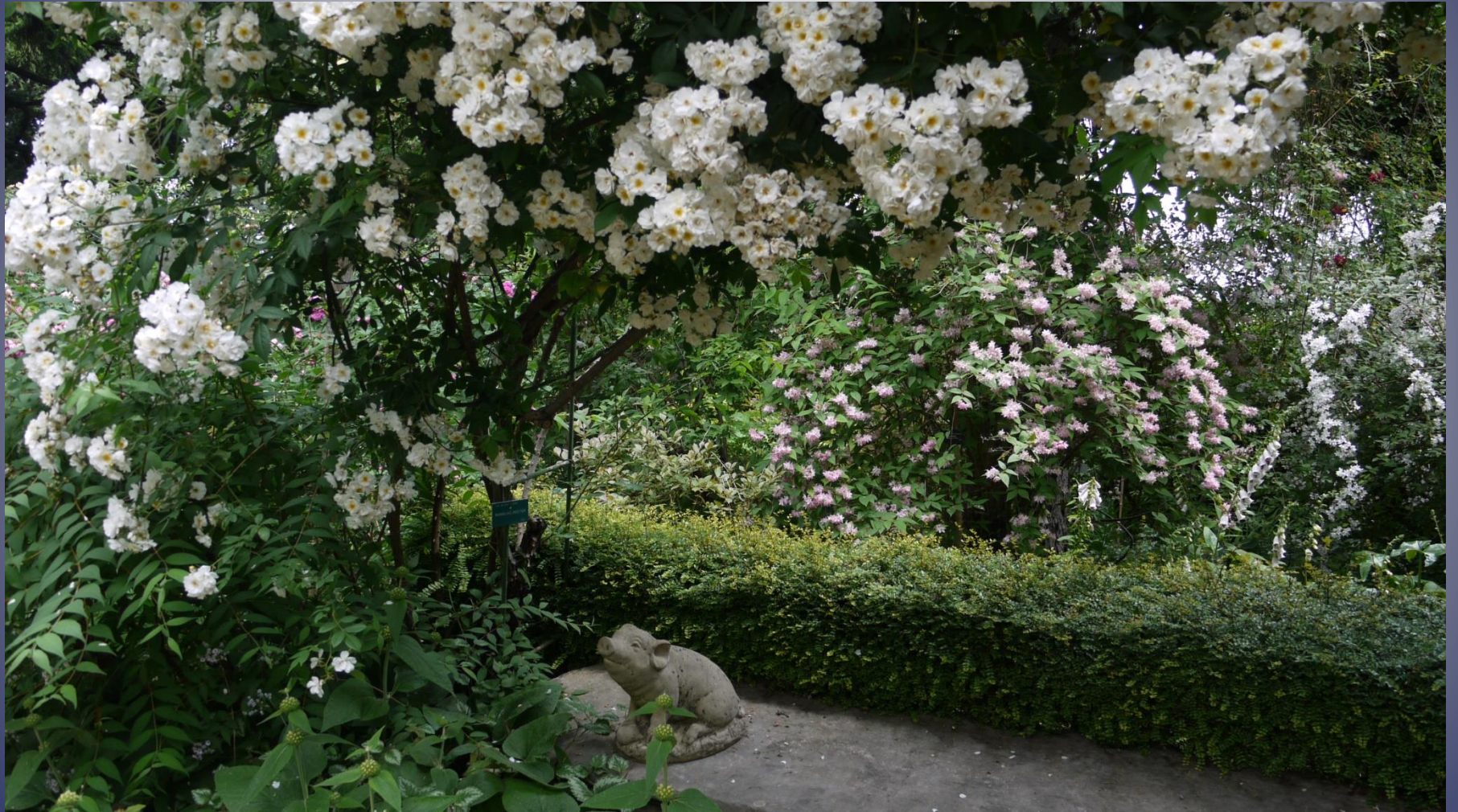
Odile Masquillier's Garden, Lyon, France