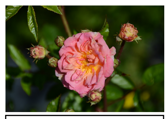
Chambersville photo of Ghislaine Feuerwerk