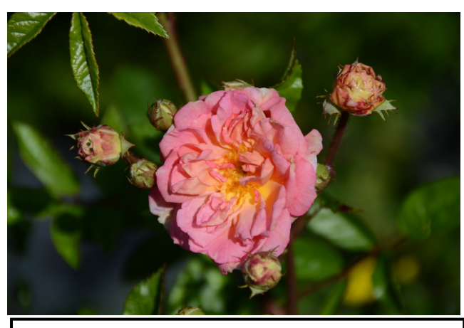
Chambersville photo of Ghislaine Feuerwerk

I searched my own database for photos of 'Gishlaine Feuerwerk' and was amazed at the great differences in the photos for the same rose from year to year and from blooms early and blooms later in the season, and obvious differences indicating if we were having a cool or warm spring that year showing up as deeper of colors in cooler weather. Stevens photo was taken recently (yes, this rambler does rebloom later in the year), my photo was taken on April 27, 2018 when it was much cooler.