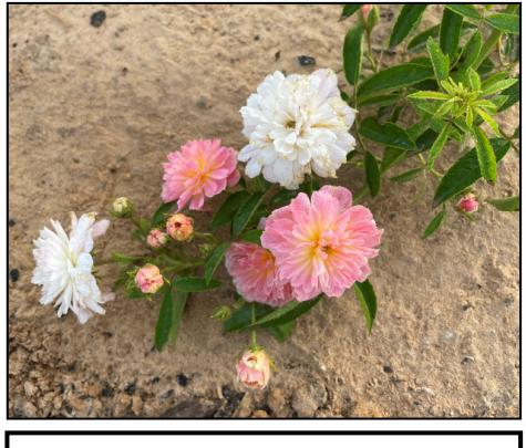
Steven's photo of Ghislaine Feuerwerk

The difference in coloration and flower form in my own photos of the same rose in the Gardens at Chambersville over a number of years and taken at different stages of bloom was truly amazing. Below are a number of the photos of Ghislaine Feuerwer taken at Chambersville over the years. These photos dramatically illustrate why it so difficult to identify a rose from a photograph.