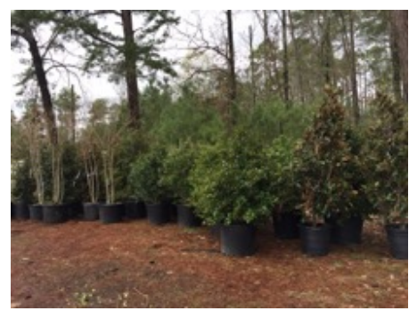
Part of a large shipment of hollies, magnolias, and crepe myrtles from Chambersville Tree Farms.