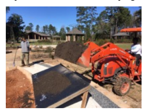
Garden Director Don Morgan devised a way to get soil safely into the planting beds, using a sheet of plywood as a slide.

A beautiful new soil mix was lifted into the 130 linear feet (x 9' wide) rose beds, and roses are being planted as of this writing. We owe a very special thank you to Chambersville Tree Farms for a big truck load of companion trees, shrubs and perennials that are landscaping the areas near McFarland Plaza and the entrance to the gardens.