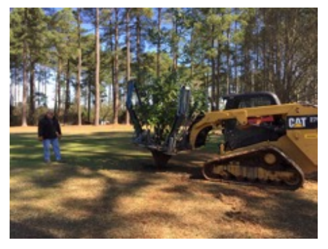
Making an effort to save three large camellias by moving them to new sites, out of the way of construction while dormant.