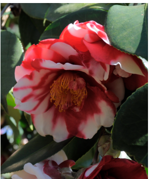
#1 'Lady Clare'; #2 'Rose Dawn'; others? Note: #6 is on same bush as #9